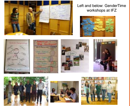
Left and below: GenderTime workshops at IFZ